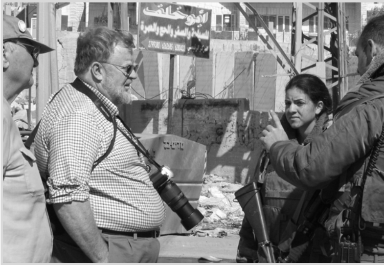
Leading an IFPB delegation in the West Bank often meant negotiating Israeli checkpoints (2003).