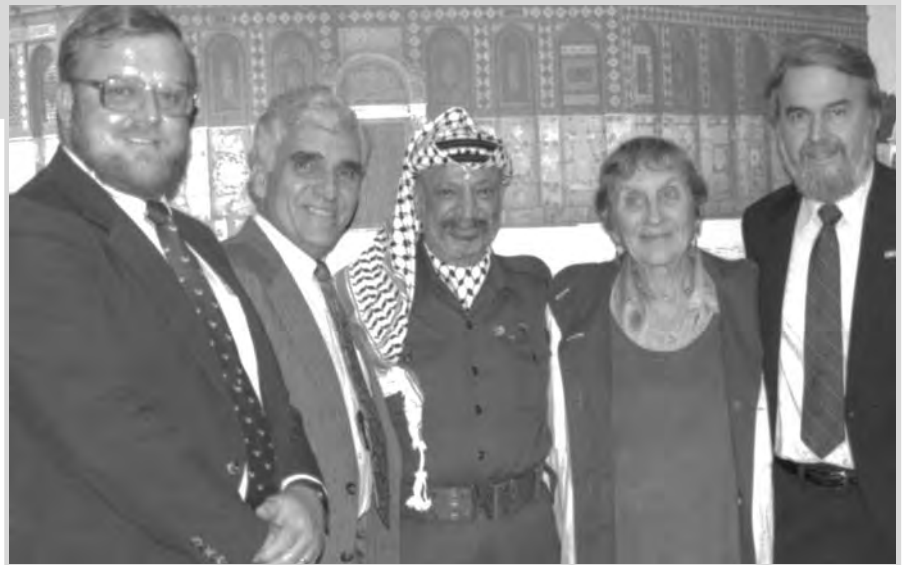
At B'Tselem's Jerusalem offices (2006).